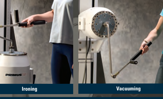
Activities of Daily Living