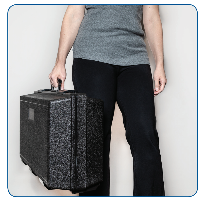
PORTABLE, MODULAR SYSTEM

Modern problems require modern solutions. That's why BTE designed the EVJ – a fully portable and modular testing platform. Tight hardware and software integration saves you time and ensures that your data is precise from one site to the next. EVJ lets you to build the ideal testing system based on your specific needs. This makes entering the world of high precision evaluation and data collection more approachable and affordable than ever.